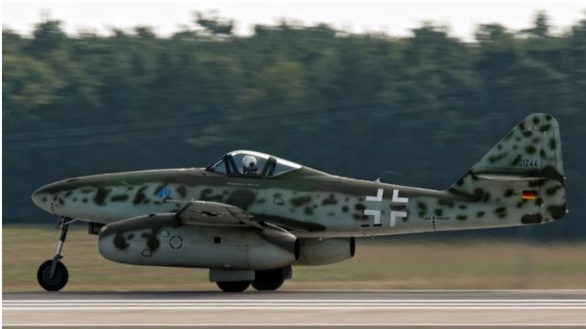
Figure 3 Fighter-bombing aircraft from World War II., Payerne, Switzerland – September 8, 2014: Messerschmitt Me 262 Luftwaffe World War II jet fighter aircraft.