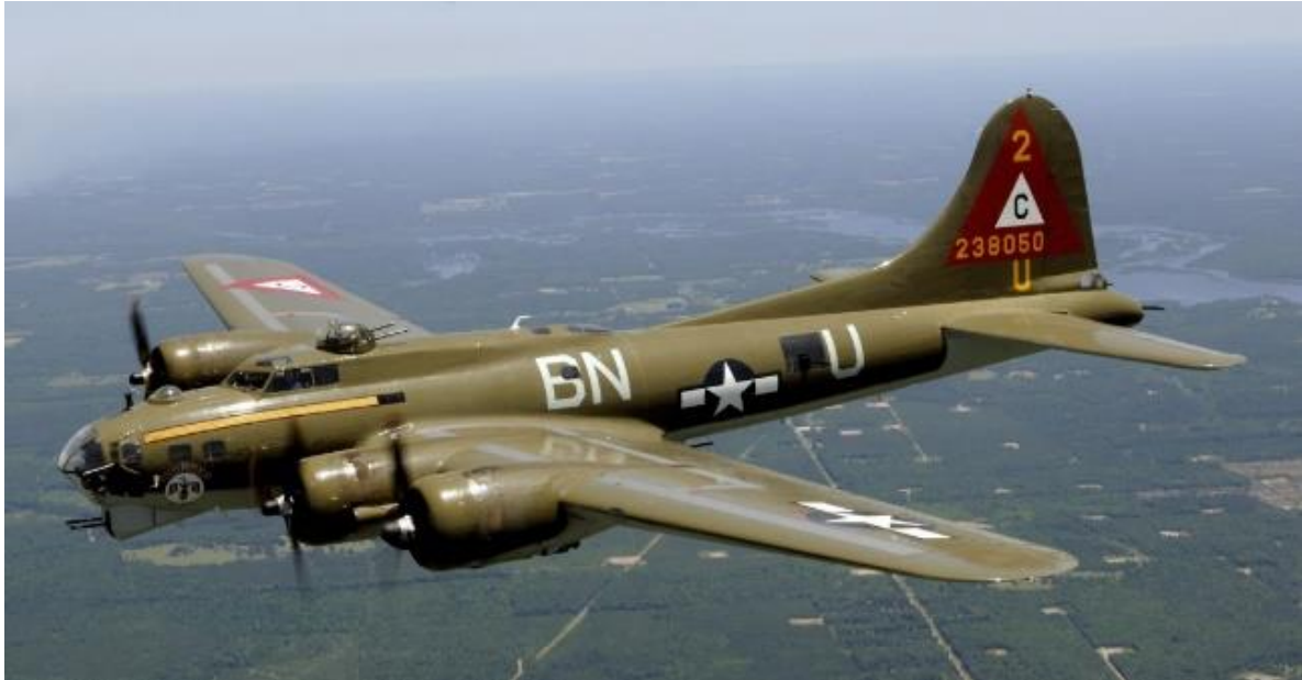
Figure 2 Bomber from World War II, Ike-battered Lone Star Flight Museum moving inland by H. Alexander, H. Chronicle, 2014, (pinrrest.com.).

The end of World War II marks the appearance of the first jet aircraft Messerschmitt Me 262 Schwalbe fighter-bombing aircraft (Swallow)( Fig.5).